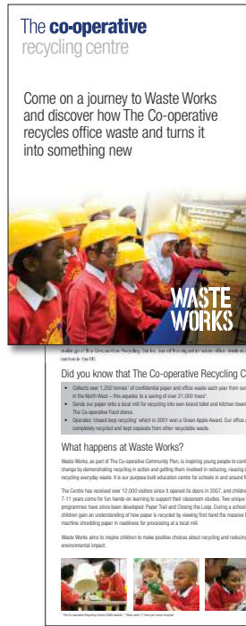
Adult and Teachers leaflets